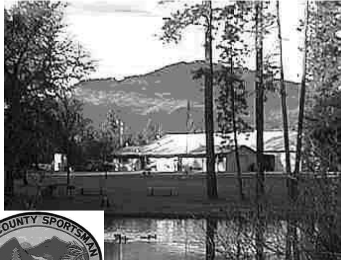
JCSA Pond & Club House

CAMPING SPACES ASSIGNED BY JCSA 541-476-2040