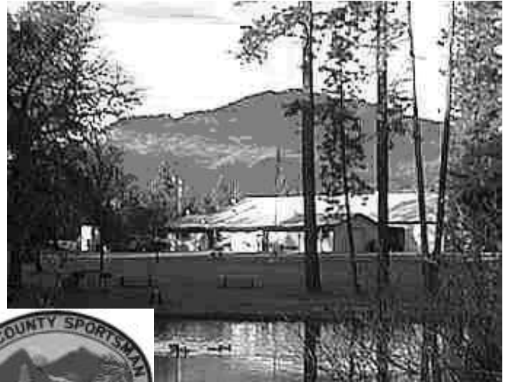
JCSA Pond & Club House