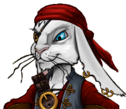
Sweetwater (One-eyed) Jack