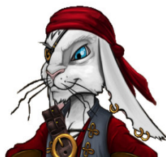
Sweetwater (One-eyed) Jack