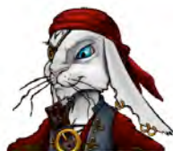
Sweetwater (One-eyed) Jack

“Fair Winds and Following Seas to you!” Arrr!