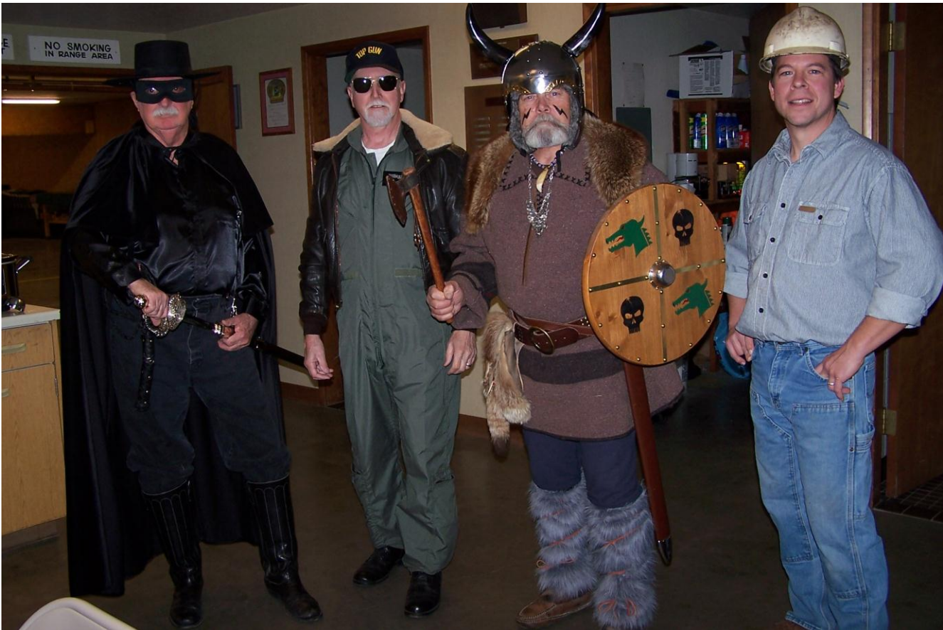
“Spanning a FEW? Time Zones”