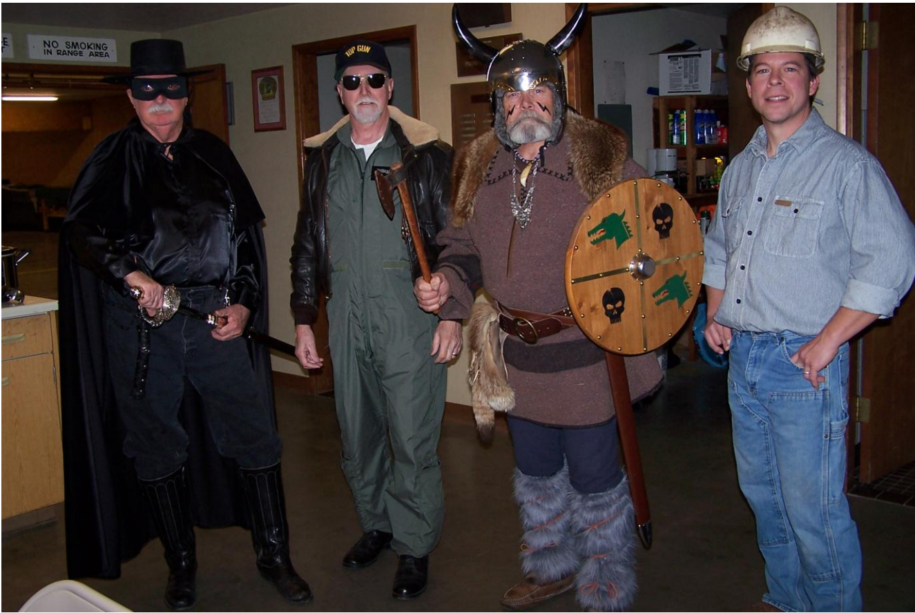
“Spanning a FEW? Time Zones”